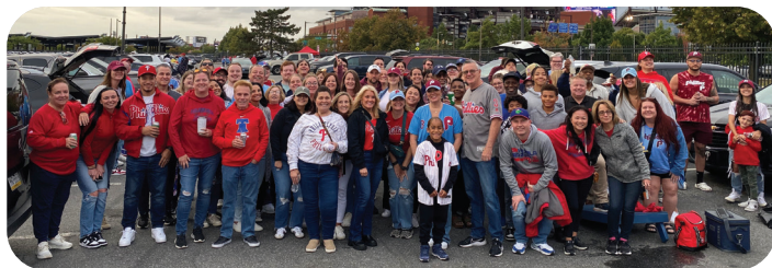
PFCU team members turned out to join with other fans on September 24, when the Phillies took on the Cubs to get to the playoffs.

On September 24, our team joined Phillies fans at Citizens Bank Park to watch the Philadelphia Phillies take on the Chicago Cubs. The excitement of the game, combined with our giveaways and community spirit, made for a memorable night as we cheered for our home team on their way to the playoffs!