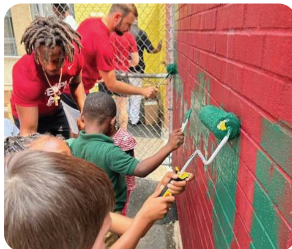
PFCU volunteers painted alongside members of the Temple Owls football team at Duckrey School, contributing to a school-wide beautification project.

Our team gave back in a hands-on way at the Dr. Tanner G. Duckrey School by funding and participating in an exterior painting beautification project held on June 11. Special thanks to the Temple University Owls football team, who volunteered alongside us to help revitalize the school's exterior with vibrant colors and creativity.